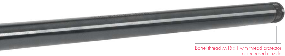
Barrel thread M15x1 with thread protector or recessed muzzle

A bolt movement that never fails to impress. Hard-chromed bolt, fine-ground for silky-soft repeating. Corrosion-protected. Two-row six locking lugs - a reliable, stable detail for the highest level of safety.