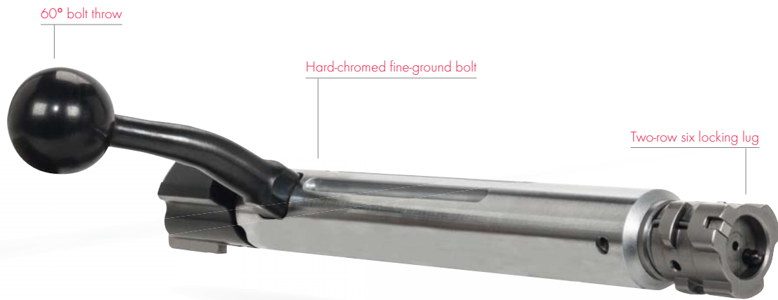
60° bolt throw