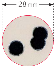
Typical 3-shot .308 Win. test fire group at 100 m*

For the following calibers, we guarantee, for 3 shots, maximum group sizes* of: