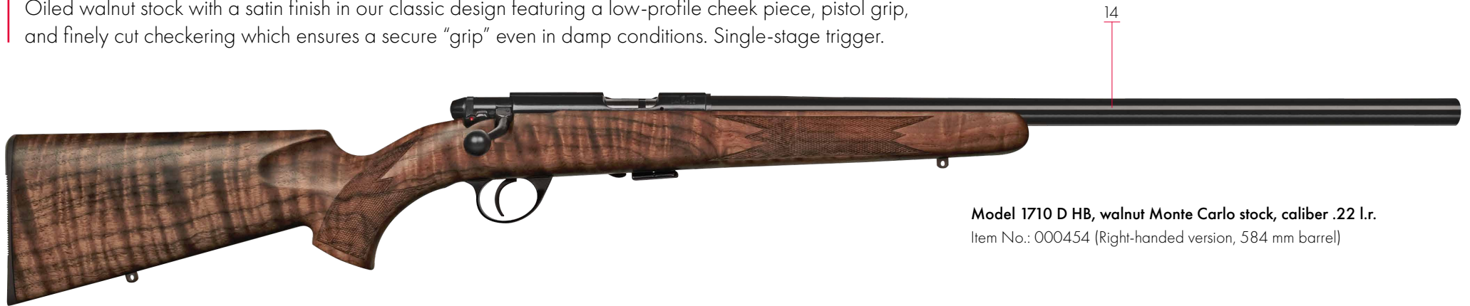
Model 1710 D HB, walnut Monte Carlo stock, caliber .22 l.r. Item No.: 000454 (Right-handed version, 584 mm barrel)

Oiled walnut stock with a satin finish in our classic design featuring a low-profile cheek piece, pistol grip, and finely cut checkering which ensures a secure “grip” even in damp conditions. Single-stage trigger.