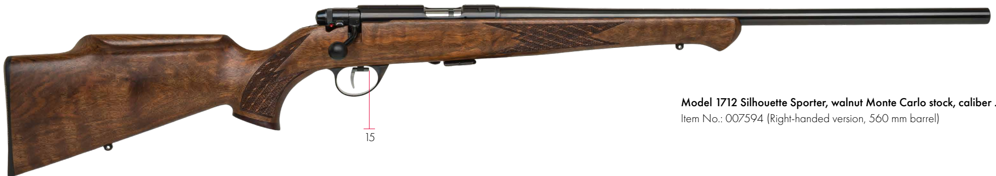
Model 1712 Silhouette Sporter, walnut Monte Carlo stock, caliber .22 l.r. Item No.: 007594 (Right-handed version, 560 mm barrel)

Oiled walnut stock with a satin finish in our Monte Carlo style, featuring a Schnabel forend, pistol grip, and finely cut checkering. Specifically designed for the NRA sport of Smallbore Silhouette, this rifle is equally at home on the range or in the field. Two-stage trigger.