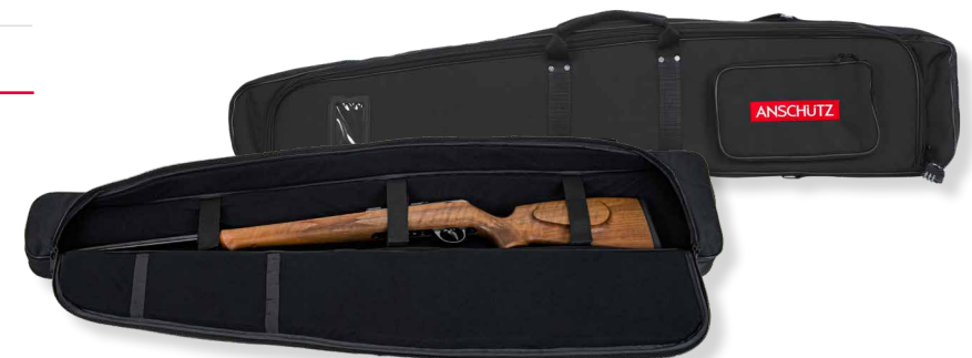
Special soft case for hunting and sporting rifles, for the safe transport of your hunting rifle. As a special feature, the new carrying strap system, including a lock, also lets you carry the soft case on your back

■ Included in the basic price □ Optional - with surcharge