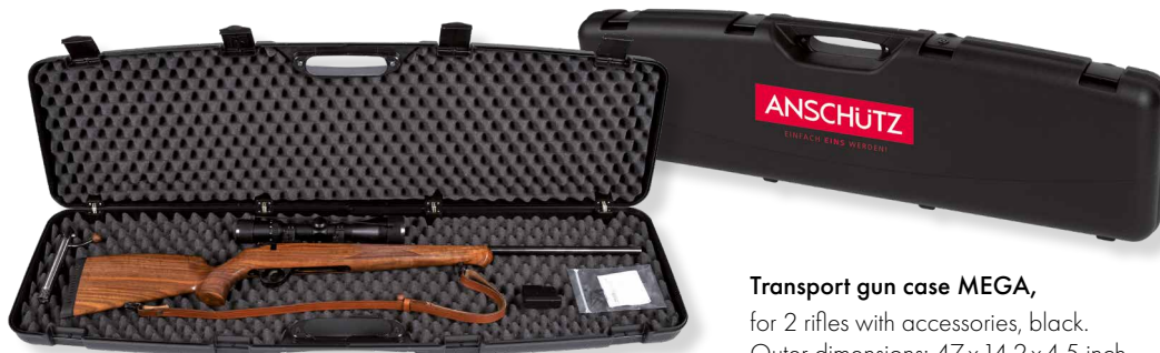
Transport gun case MEGA, for 2 rifles with accessories, black. Outer dimensions: 47 x 14.2 x 4.5 inch, Inner dimensions: 46.6 x 13.4 x 3.5 inch, Weight: 7.7 lbs