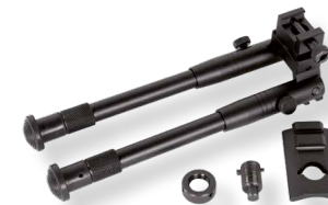
Bipod made out of aluminum, adjustable in length and foldable