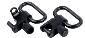
Sling swivels, 1" Optimum solution for a fast exchange and removal of gun slings