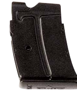
Magazine standard, 5-shot, caliber .22 l.r.