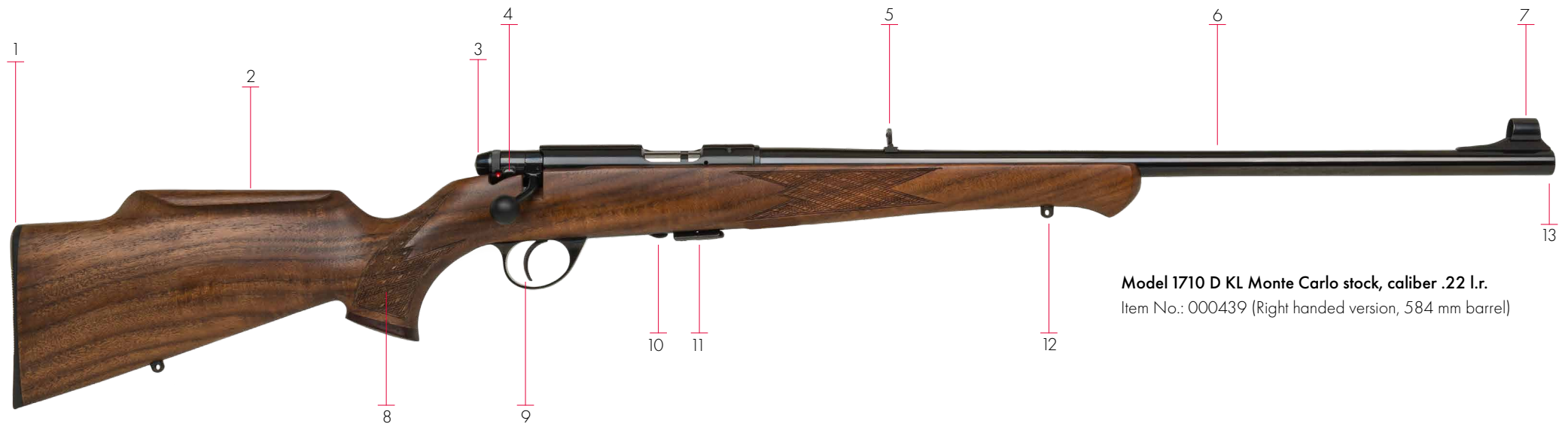
Model 1710 D KL Monte Carlo stock, caliber .22 l.r. Item No.: 000439 (Right handed version, 584 mm barrel)

Oiled walnut stock with a satin finish in our Monte Carlo style, featuring a Schnabel forend, pistol grip, and finely cut checkering. The roll-over cheek piece supports shooting with the telescopic sight. Single-stage trigger. Folding-leaf sight and vertically adjustable front sight. 11 mm dovetail groove on receiver for scope ring mounting.